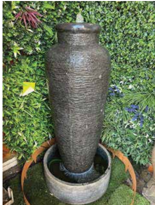
GUCCI POT PUMP, H=1.30 $950.00