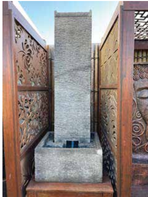
WAVE W/F, PUMP, H=1.65M $950.00