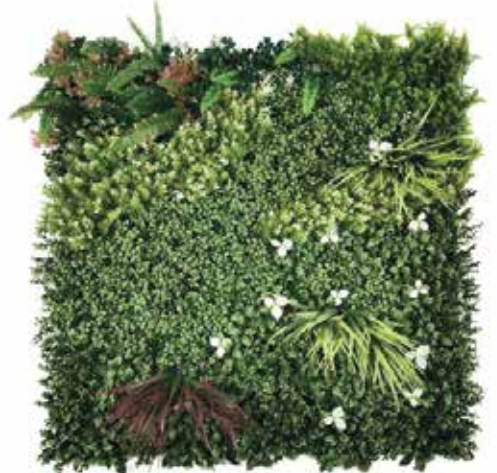
AUTUMN BLOSSOM 100X100CM OD A076 - $80