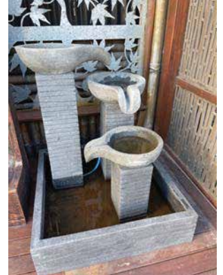
ZEN CIRCA W/F H=1.5M, PUMP $1,250.00 ECLIPSE W/F , H= 1.6M, PUMP $1,250.00 STRING WF, H=1.5M, PUMP $1,250.00 TRIO BOWL W/F, H= 90CM $950.00/EA