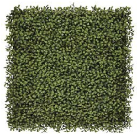
OD-A0019-WINTER GREEN 50CM X 50CM $15