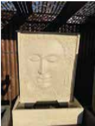
BUDDHA FACE W/F, PUMP, H=1.55M $1,250.00