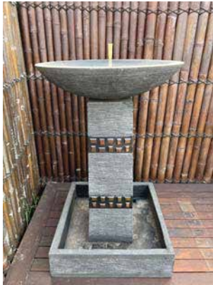
PYRAMID W/F, PUMP, H=1.25M $1,250.00