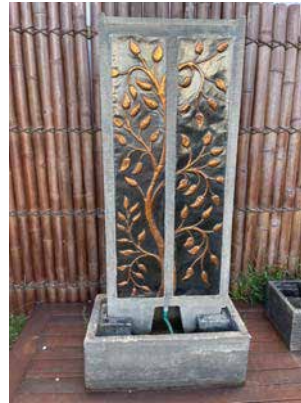
FEAFY W/F, PUMP, H=1.70M $1,550.00