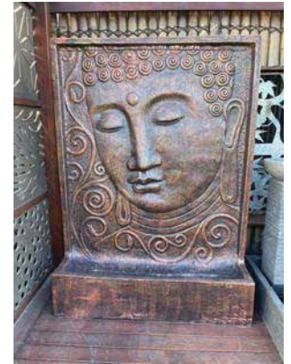
BUDDHA FACE W/F, PUMP, H=1.55M $1,250.00