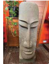
TOPENG 110CM $250.00